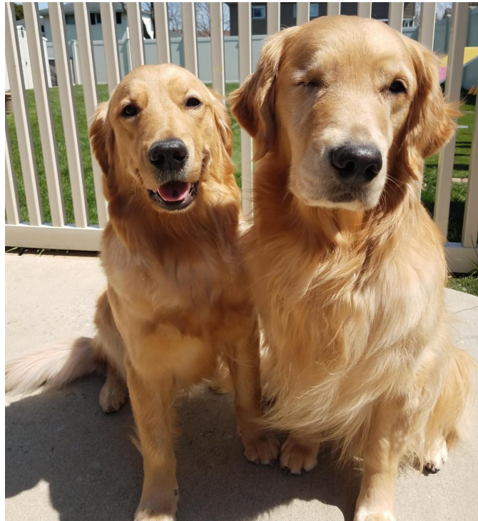
Token and Trinket

Sandy Hamburg has been keeping up on training, earning Trick dog titles with Token and Trinket, who BOTH earned their AKC Intermediate Trick Dog titles!