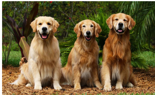
Zee, Ellie and Parker