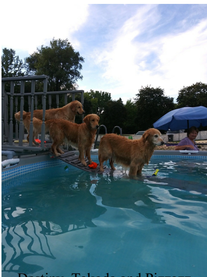
Destiny, Takoda and Pizzazz