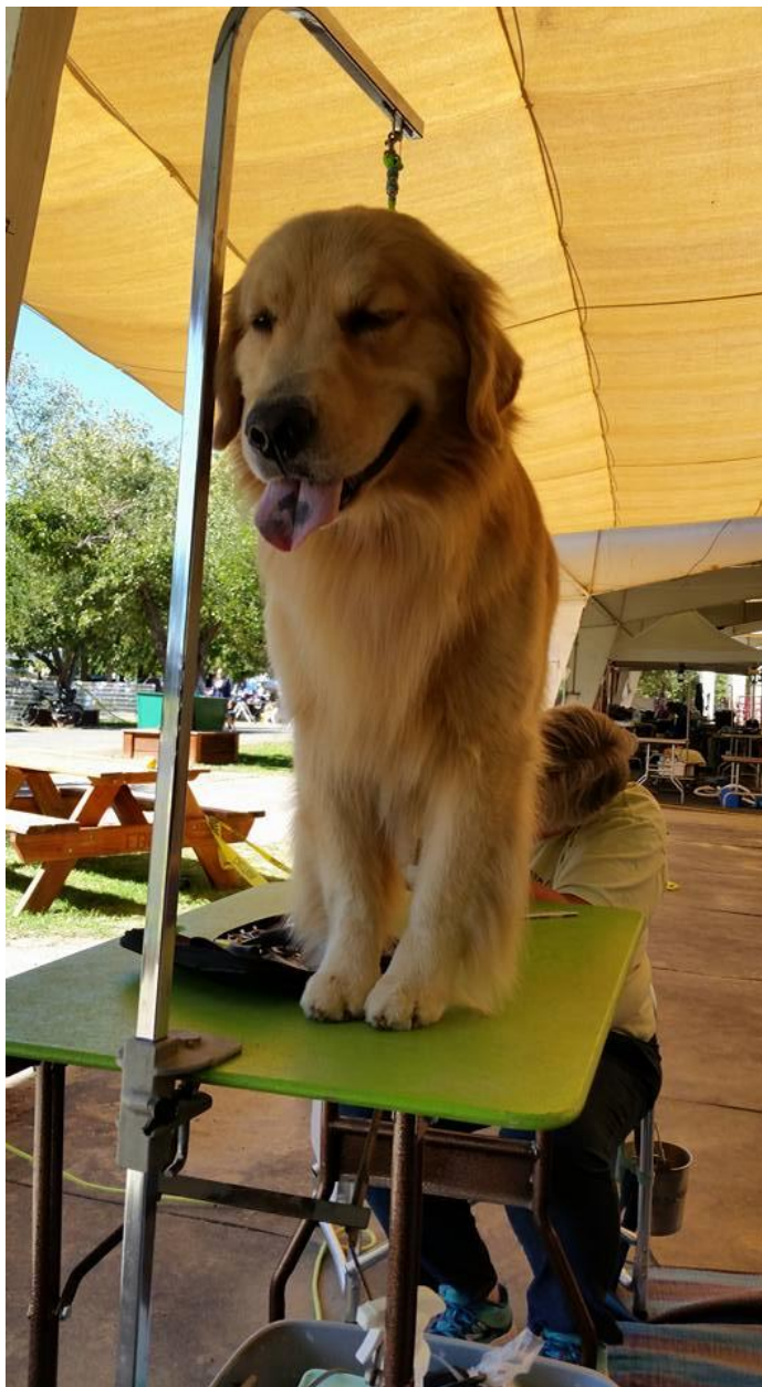
Journey getting ready to show at the National