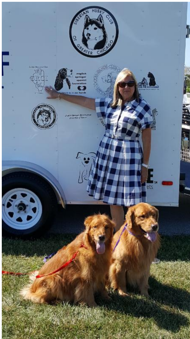
As a sponsor of the trailer, GRCI's logo is displayed on the side.