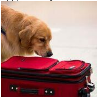
Emmett's NW2 container search