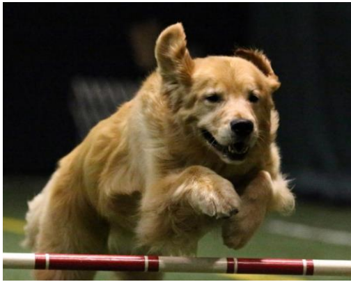
Dempsey in action!