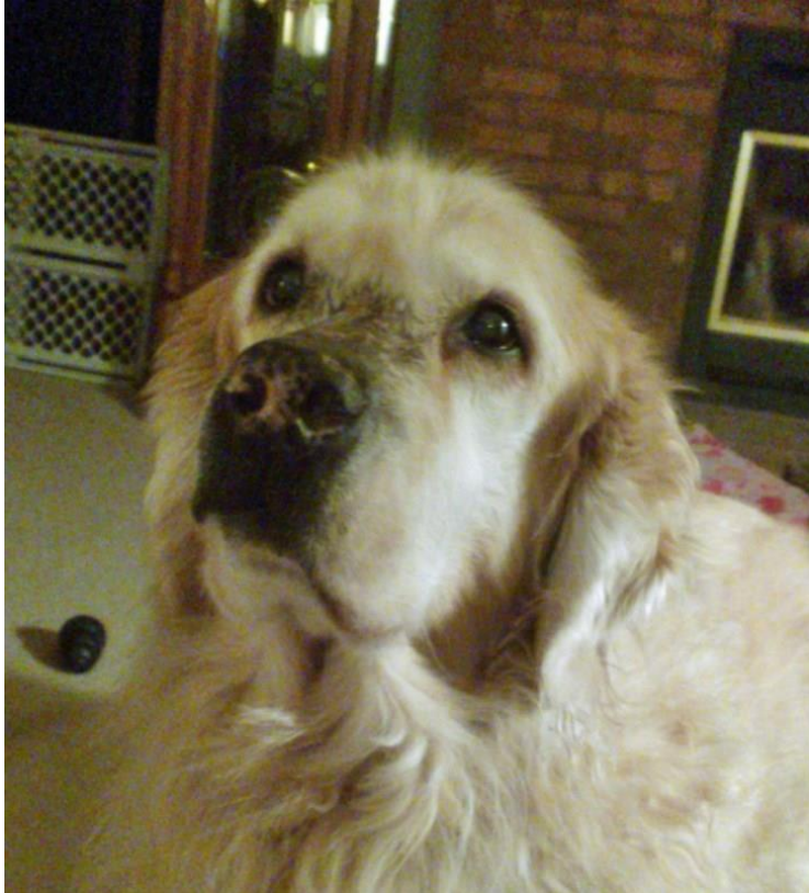
Charger after 4 radiation treatments. Hair on his nose growing back.