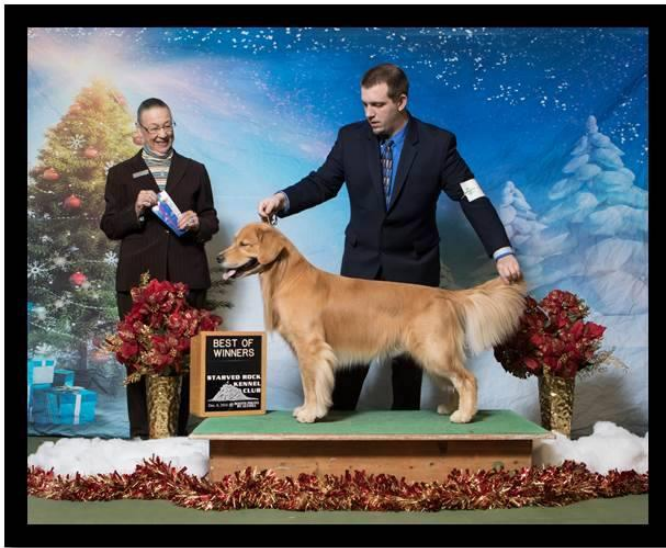
Parker is Winner's Dog at Starved Rock KC Day 1