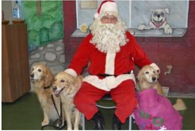
Santa brought toys for all the Golden Retrievers at our Annual Holiday Party!