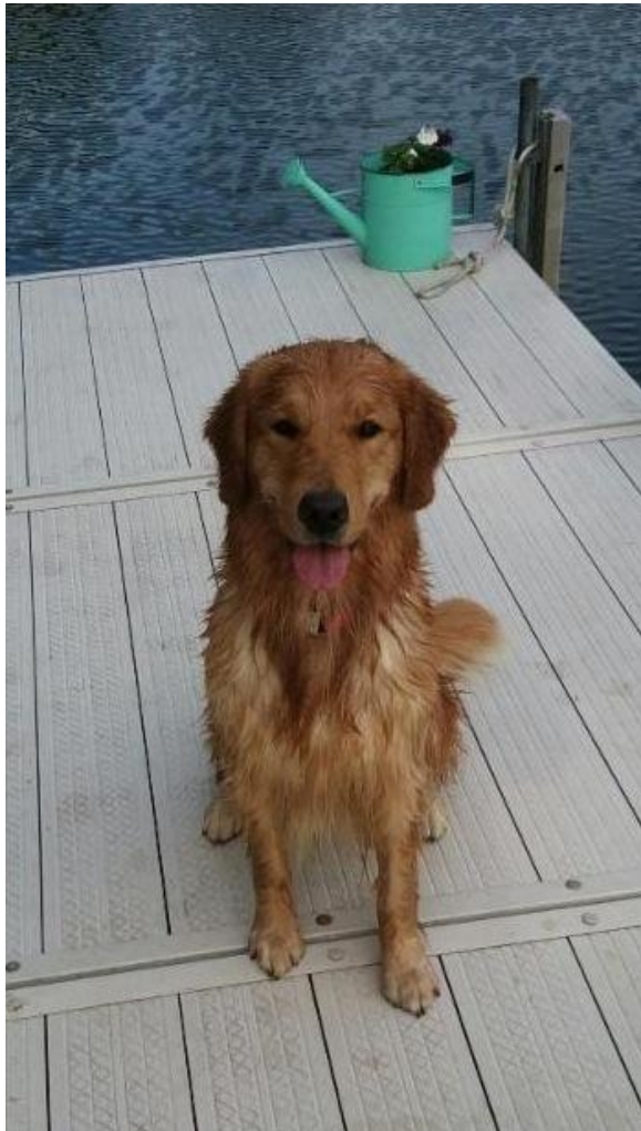
Takota after a fun swim!