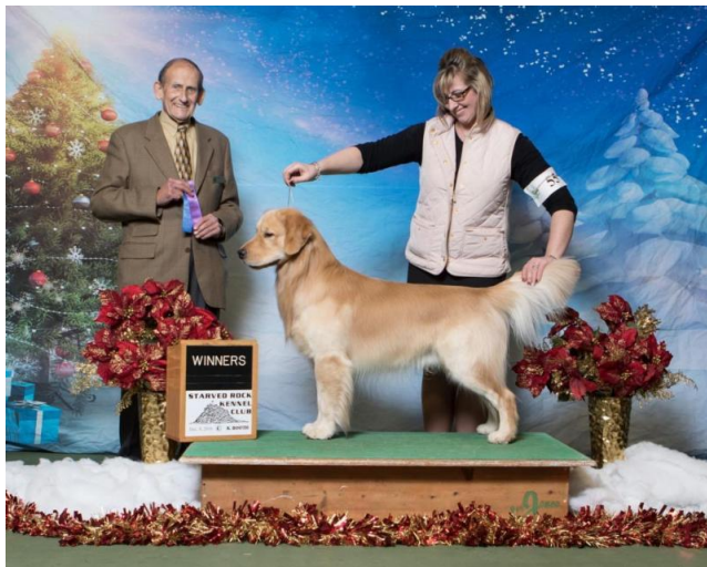
Driver is Winner's Dog at Starved Rock KC Show Day 2