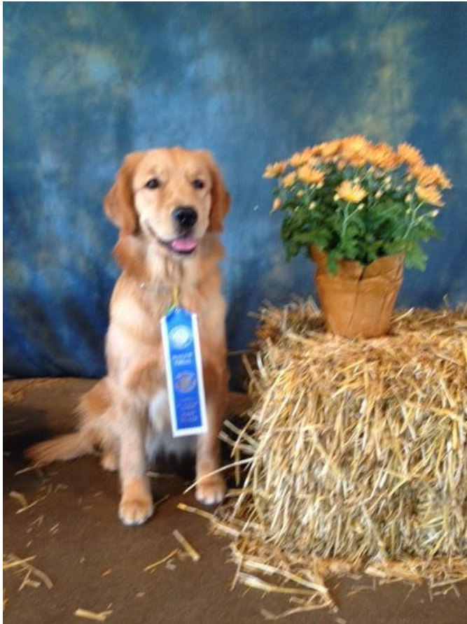
Loosey at Fox Valley DTC winning the Rally Advance B class