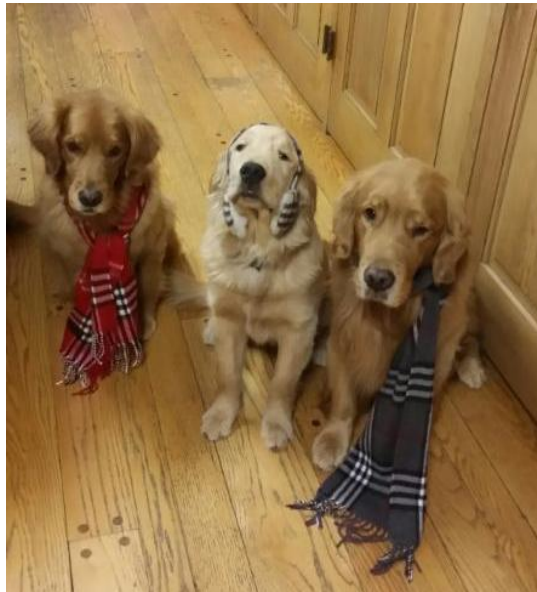
Vente, Vinny and Vespa hope you stay warm!!

CHF supports the funding of this effort and will oversee administration of funds and scientific progress. For more information about this grant, or to learn about the work of the AKC Canine Health Foundation, visit www.akcCHF.org .