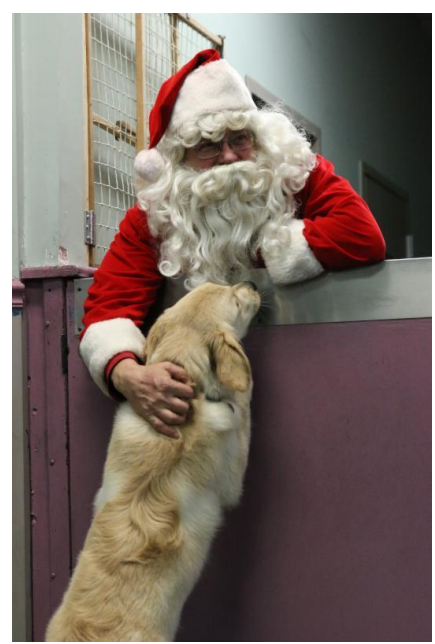
Santa visits a sweet pup!