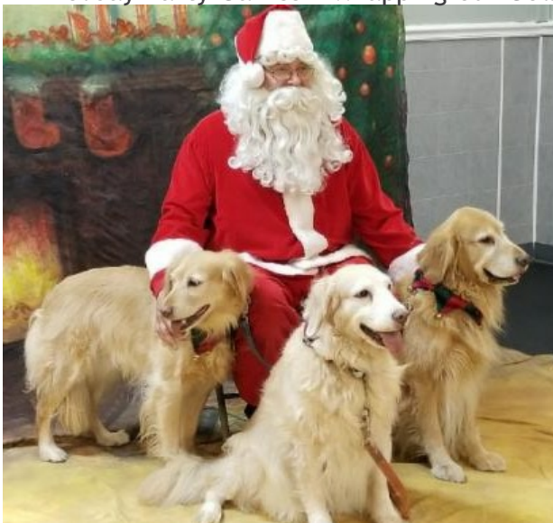
Santa and his Golden Helpers