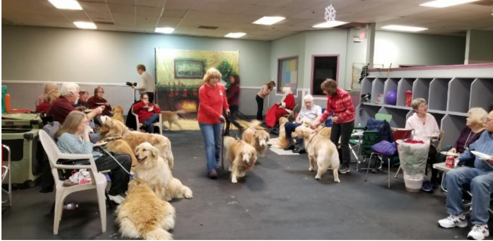
Fun, Food and Festivities!